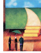
We walk far together.

Weekly Del Mar Campus, PTA & Foundation News