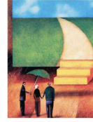
We walk far together.

Weekly Del Mar Campus, PTA & Foundation News